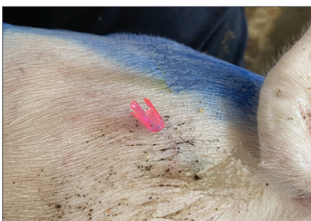
Figure 3: Highly visible extraction collar in pig