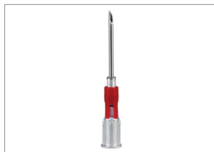
Figure 4: D3X needle assembly